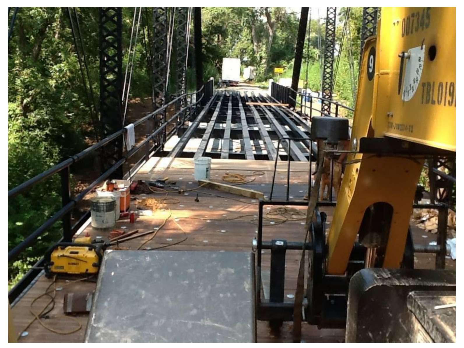
Installing the new deck.