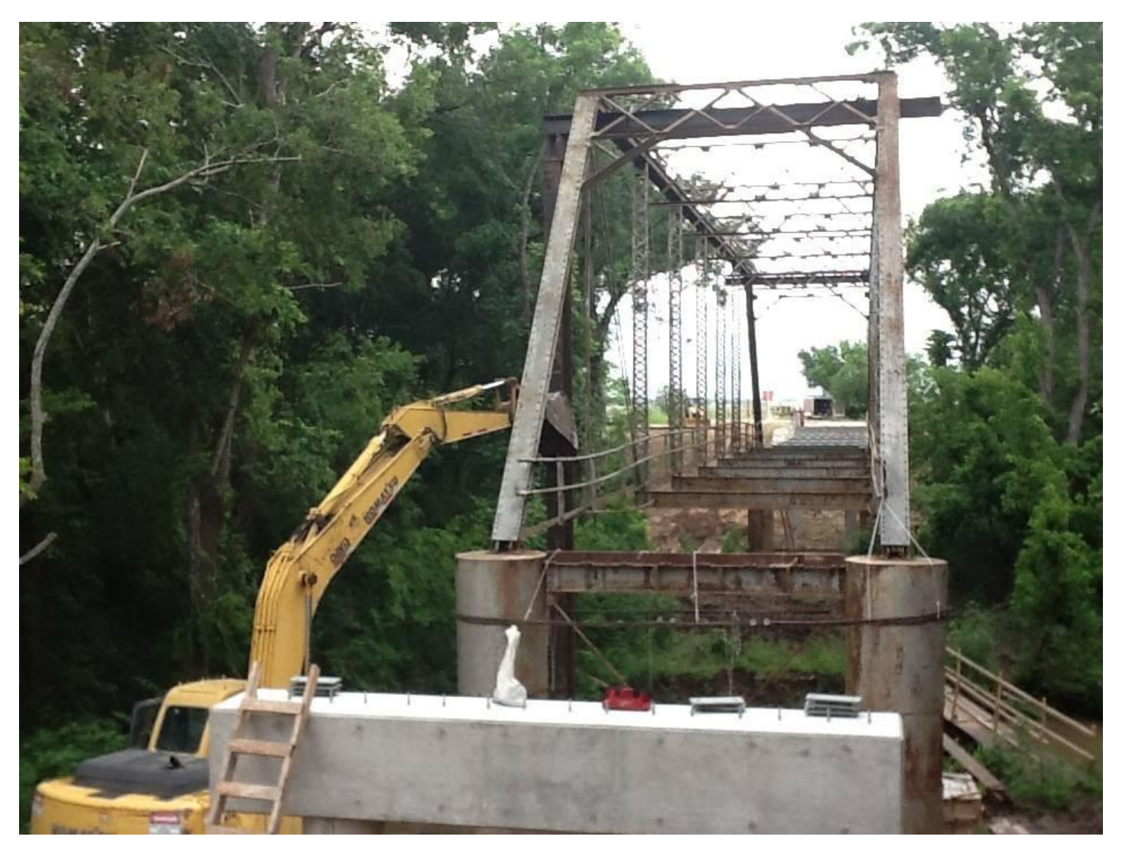
Truss before restoration, after deck removal.