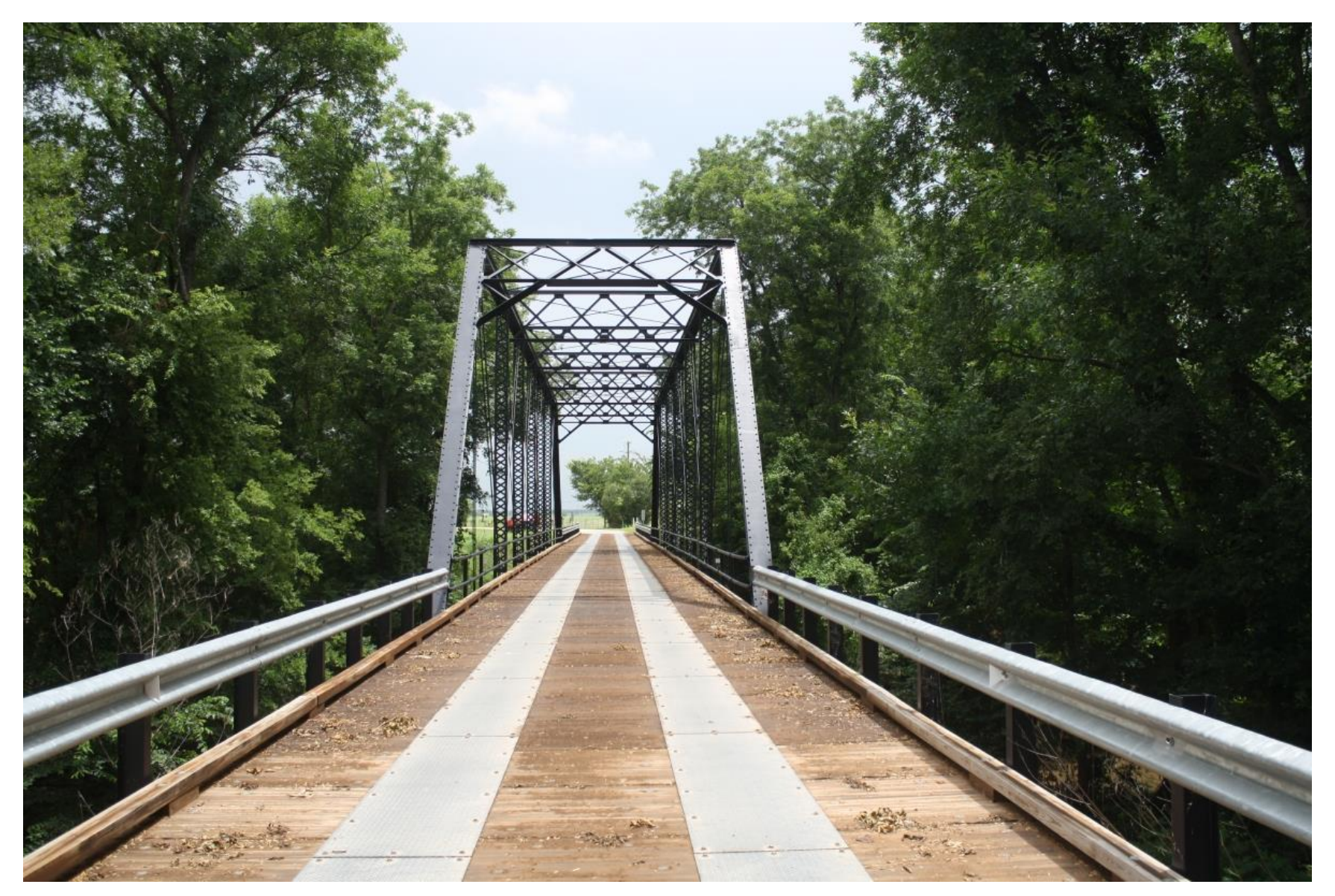
View of the bridge a couple years after it had been completed.