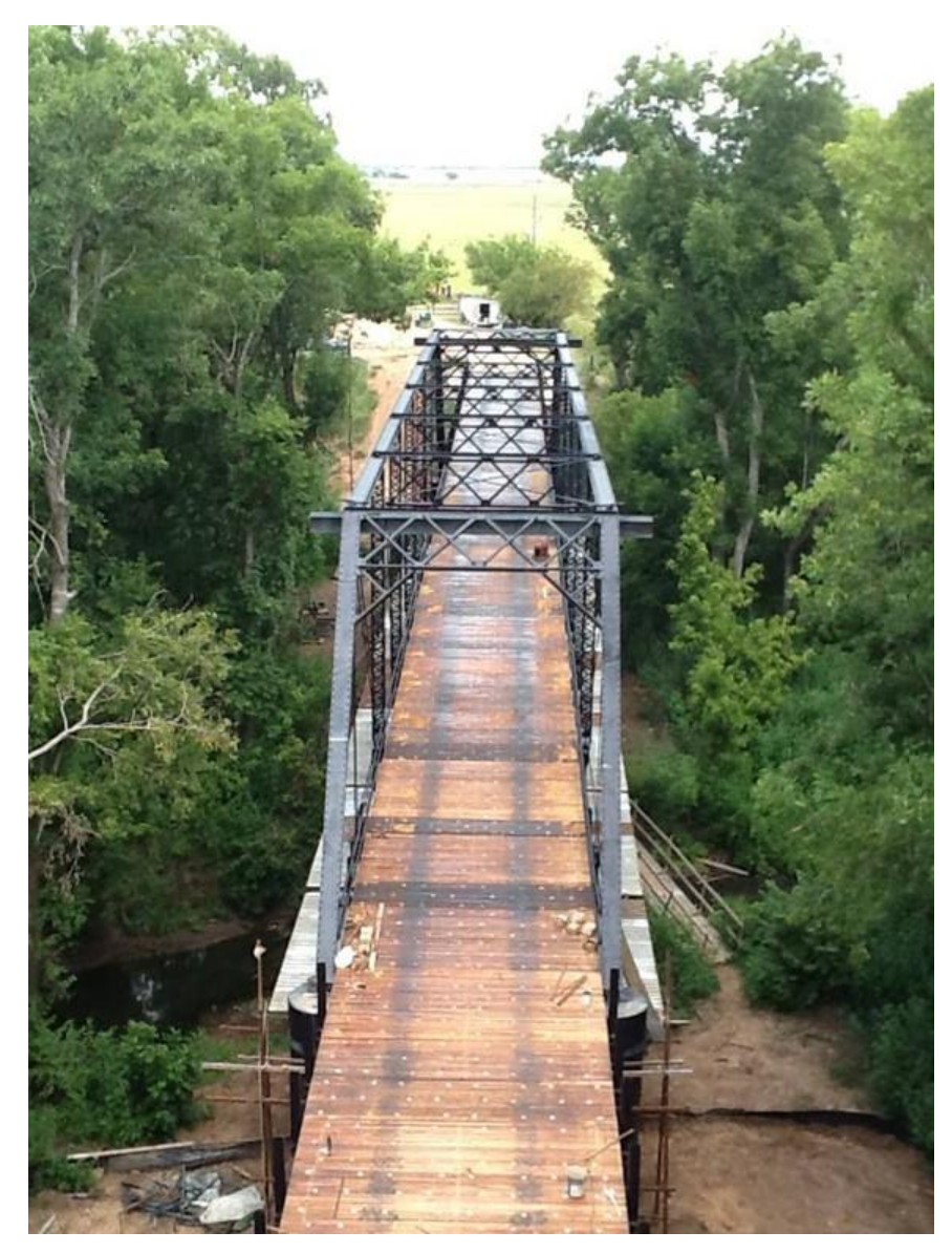
Bridge with new deck in place.