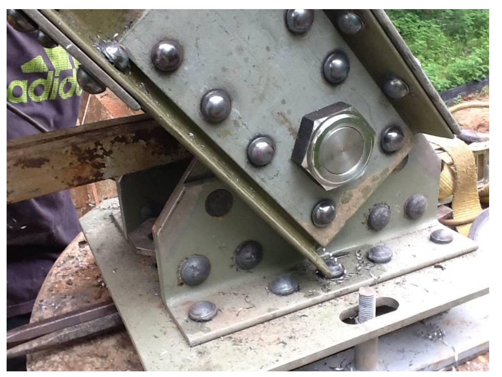
Replicated bridge shoe and endpost base.