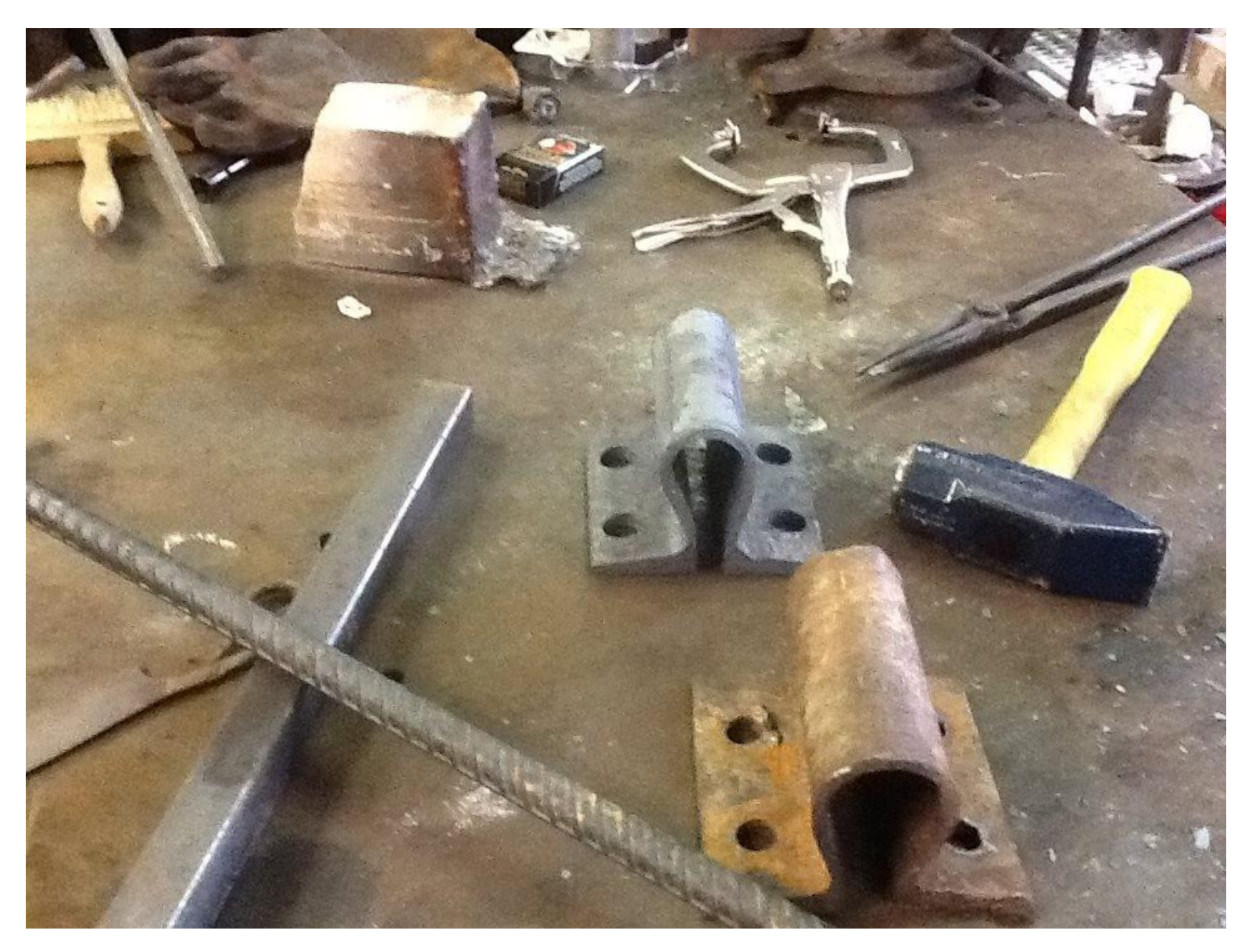
Replica attachments for the overhead lateral bracing had to be made. Original attachment in lower portion of photo, replica is above.