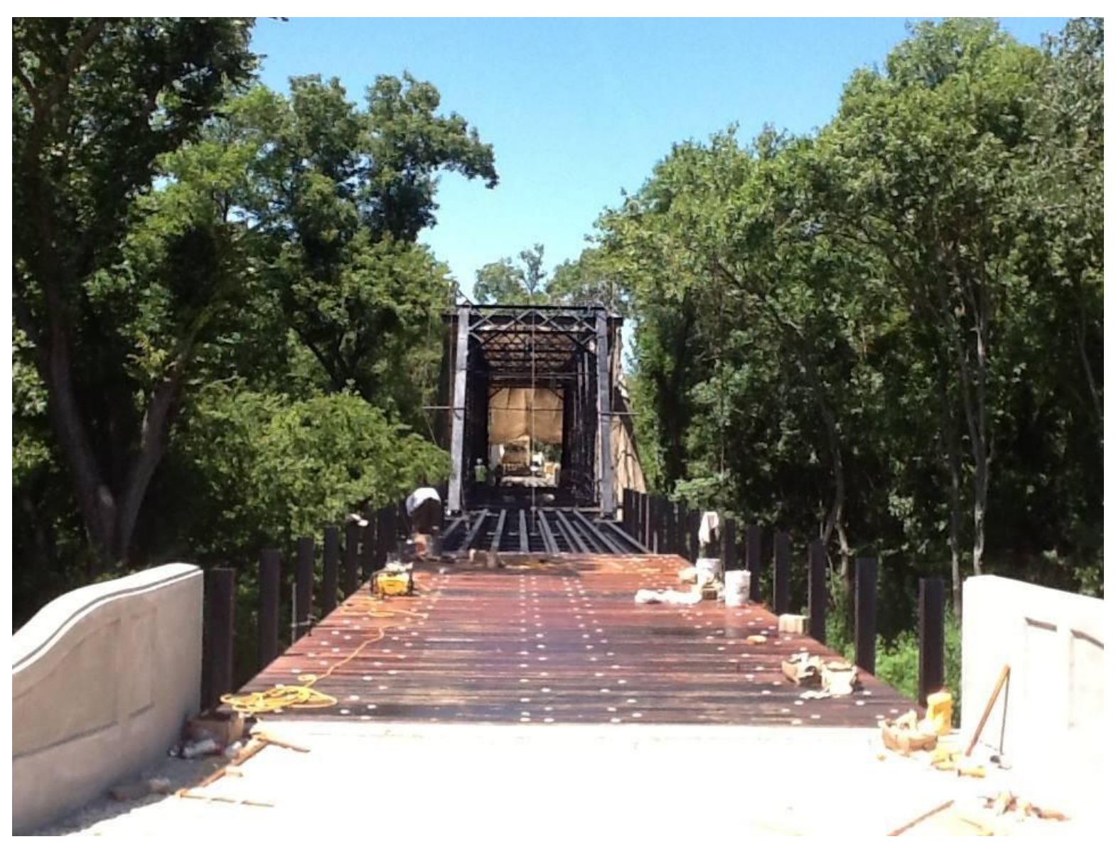
Repainting the bridge.