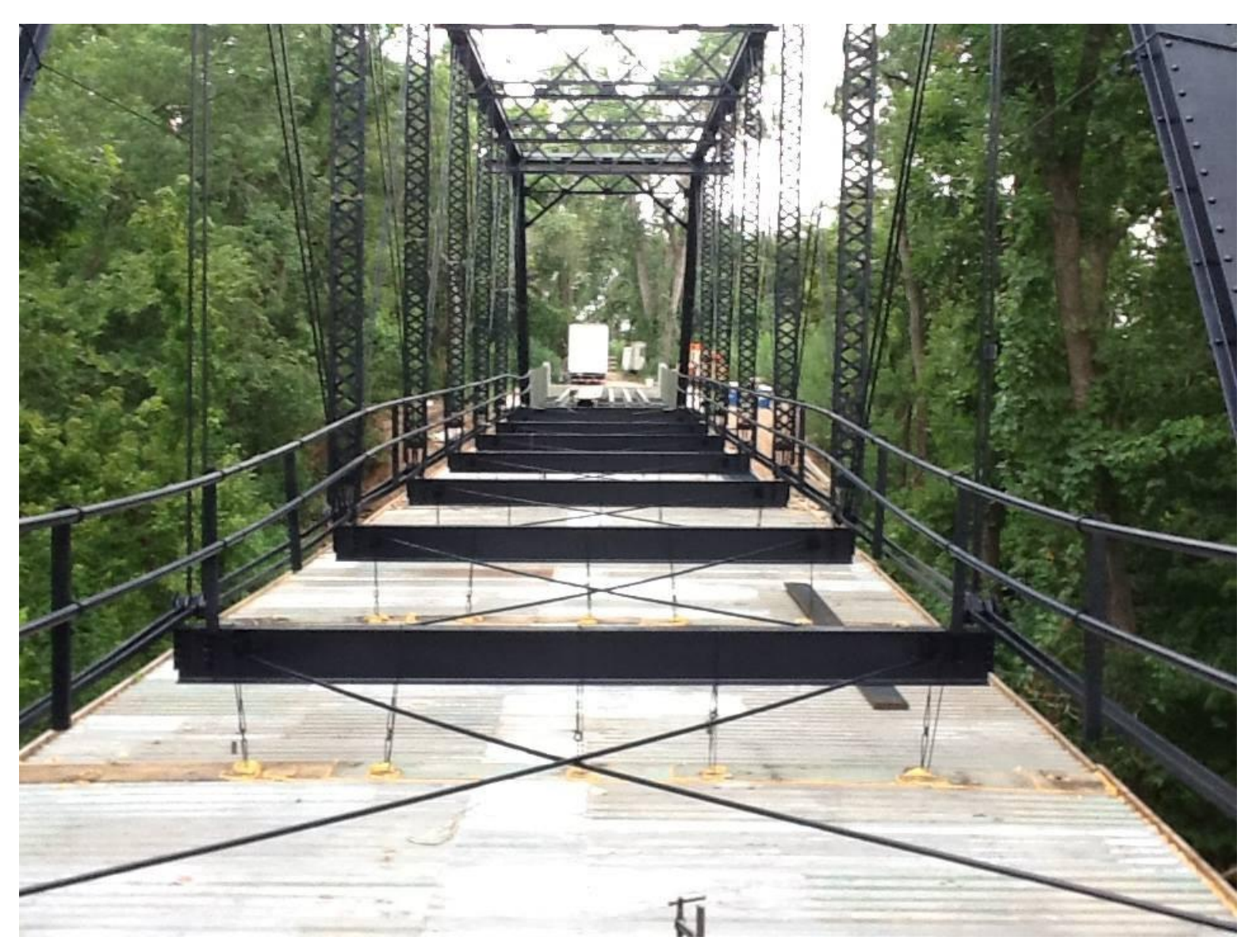
Restored and repainted truss awaiting deck stringers and a new deck.