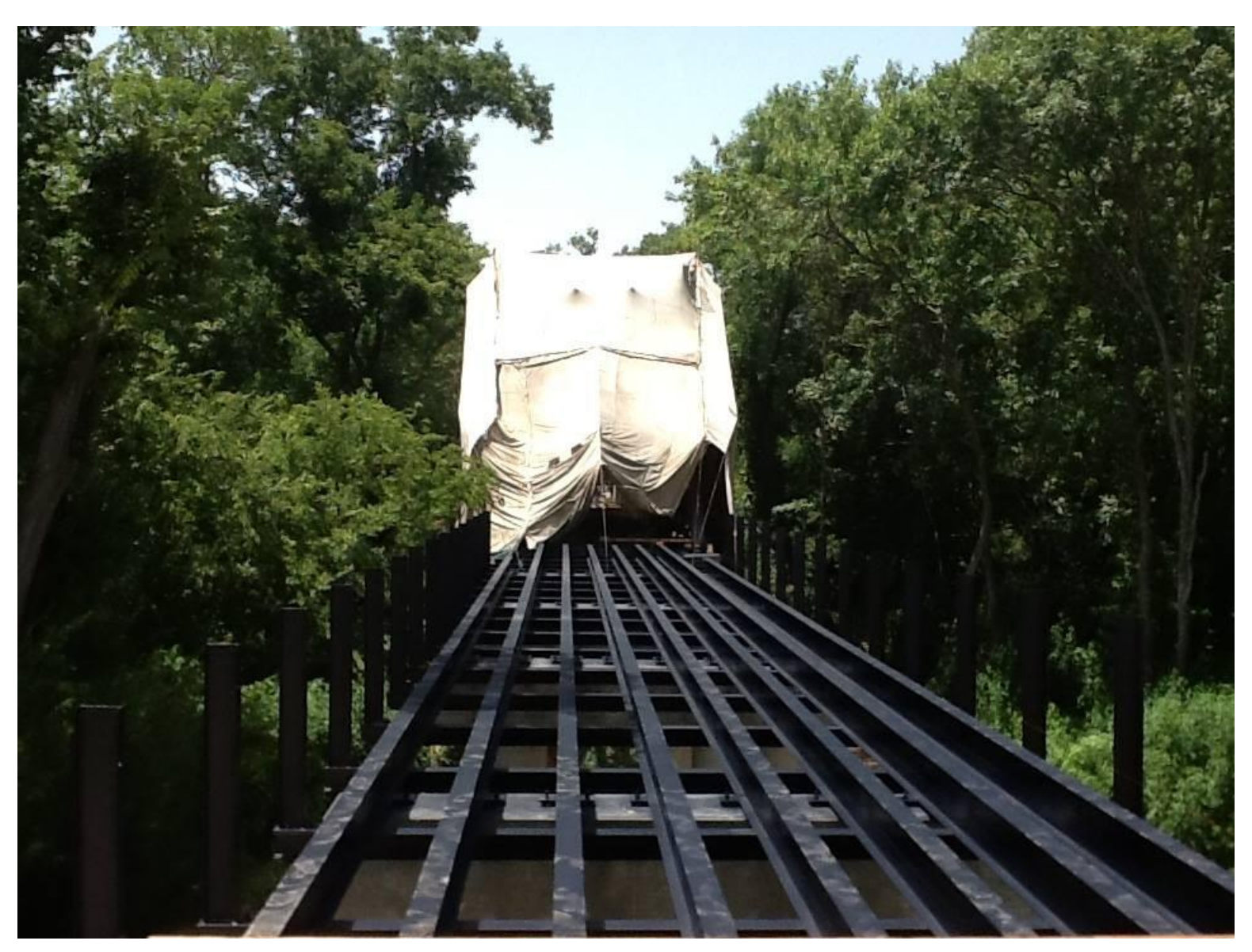
Repainting the bridge.