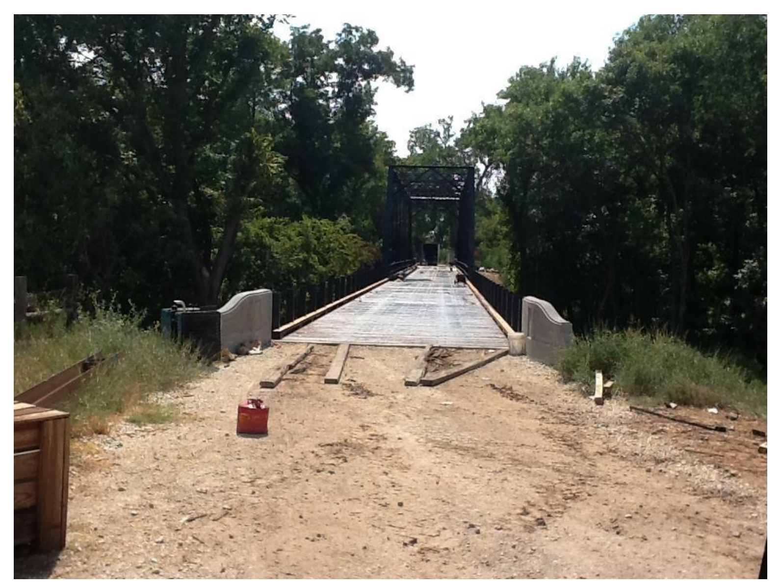
Bridge with new deck in place.