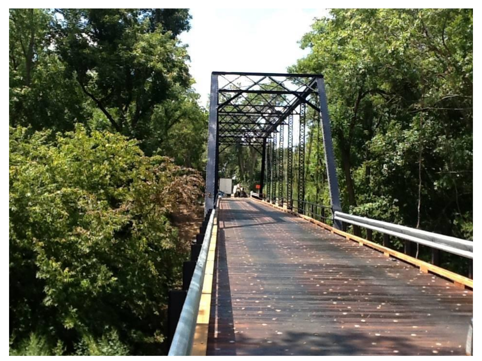
Restored truss with new deck installed.