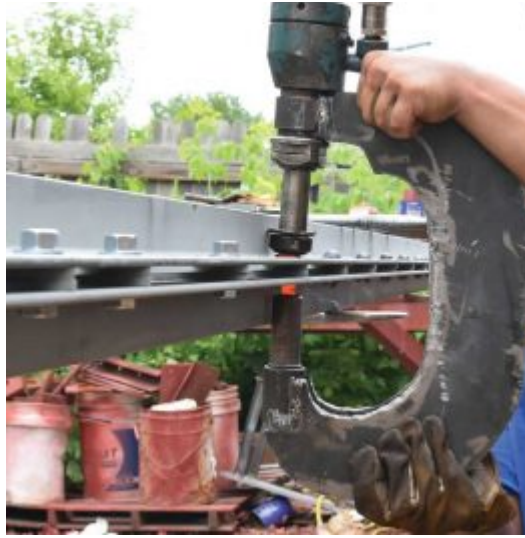
Figure 4. Shop riveting a new edge bracing member using a hydraulic riveter.

While repairs to the truss were underway, abutment construction was accomplished at Lazy Brook Park, the new home for the historic bridge. A noteworthy aspect of this work was that the new concrete abutments were faced with some of the original stones that had been salvaged from the dry-laid stone abutments at the original bridge location. The original stones were transported to the new site, cleaned, cut down to an approximate 6-inch thickness, and attached with mortar to the freshly cast concrete abutments. This had the benefit of preserving some of the original abutment materials and also provided a more realistic simulation of a stone abutment.