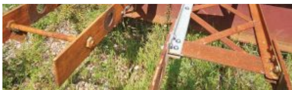
Figure 3. Completed shop repairs of vertical members. New steel is painted grey in this photo.

The built-up vertical members and portal bracing on the bridge were in good condition overall. However, some sections had been impacted by vehicles, and one vertical member had been crudely repaired with welded splices in the angles. Rather than completely replace these damaged members, a partial replacement was undertaken. The impacted and poorly repaired areas of the verticals were removed and replaced with new steel riveted to match the original sections ( Figure 3 ). Similar repairs were made to the portal bracing. The bridge's floorbeams are built-up, variable depth, "fishbelly" shaped beams. Some of them had section loss on the angles and at the lateral bracing connections. Deteriorated angles were removed and replaced with new angles riveted to the beams. The lateral bracing connection areas were strengthened by adding a small riveted plate to provide additional cross-sectional area. Once the top chord splices were disassembled, cracking between rivet holes was discovered. The original splice plates were replaced with slightly larger plates to develop a friction connection that would provide a secure splice, to avoid having to replace these members or rely on a welded repair.