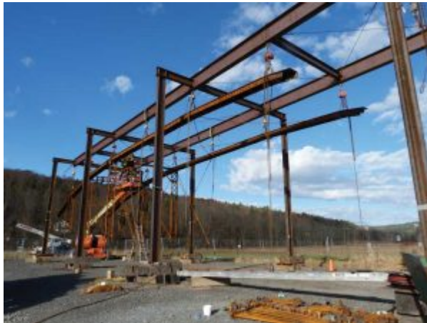
Figure 2. Disassembly of the bridge.

After removal of the steel deck stringers, disassembly of the truss itself was completed generally from the bottom to the top, with the floorbeams, lower bracing, and lower chords removed first ( Figure 2 ).