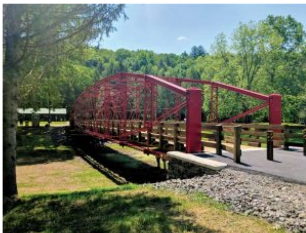
Figure 6. The completed Pierceville Bridge at Lazy Brook Park.

In its new location, the bridge is a centerpiece landmark and attraction. The bridge was painted a vibrant red to catch the attention of park visitors and highlight the bridge's distinctive lenticular truss. Interpretive signage, which is mounted on a salvaged section of one of the original truss bridge end posts, informs park visitors of the bridge's history and significance. The overall project represents a positive outcome for all involved, by providing SR-1029 with a new bridge meeting the needs of that roadway and preserving one of the rarest historic truss bridges in Pennsylvania. ■