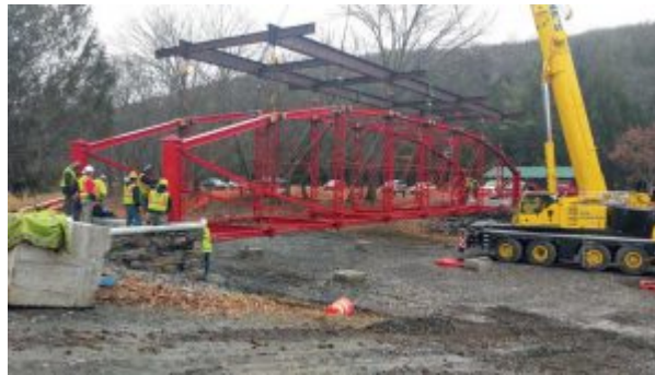
Figure 5. The restored truss is placed on the new abutments at Lazy Brook Park.

While repairs to the truss were underway, abutment construction was accomplished at Lazy Brook Park, the new home for the historic bridge. A noteworthy aspect of this work was that the new concrete abutments were faced with some of the original stones that had been salvaged from the dry-laid stone abutments at the original bridge location. The original stones were transported to the new site, cleaned, cut down to an approximate 6-inch thickness, and attached with mortar to the freshly cast concrete abutments. This had the benefit of preserving some of the original abutment materials and also provided a more realistic simulation of a stone abutment.