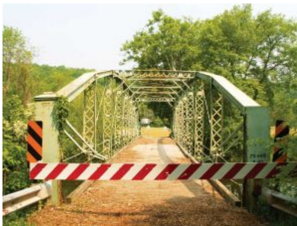
Pierceville Bridge before.

The 113-foot Pierceville Bridge was built in 1881 to carry SR-1029 over Tunkhannock Creek in Wyoming County, Pennsylvania. The Pierceville Bridge is a rare lenticular truss bridge, so-called because the top and bottom chords of the trusses create a distinctive “lens” shape. The single span bridge is 113 feet 8 inches long with a width of 14 feet 9 inches between centers of trusses. Only five lenticular truss bridges remain in Pennsylvania, including the well-known Smithfield Street Bridge in Pittsburgh. The Pierceville Bridge is also noteworthy because it is the oldest lenticular truss bridge in Pennsylvania and one of the oldest lenticular truss bridges in the United States. It was built by the Corrugated Metal Company of East Berlin, Connecticut, which later changed its name to the Berlin Iron Bridge Company and was a promoter of this bridge type. The company held rights to inventor William Douglas’ patent for a distinctive variety of lenticular trusses. Except for the Smithfield Street Bridge, which was designed by Gustav Lindenthal, all other surviving lenticular truss bridges in America were designed and built by the Corrugated Metal/Berlin Iron Bridge Company.