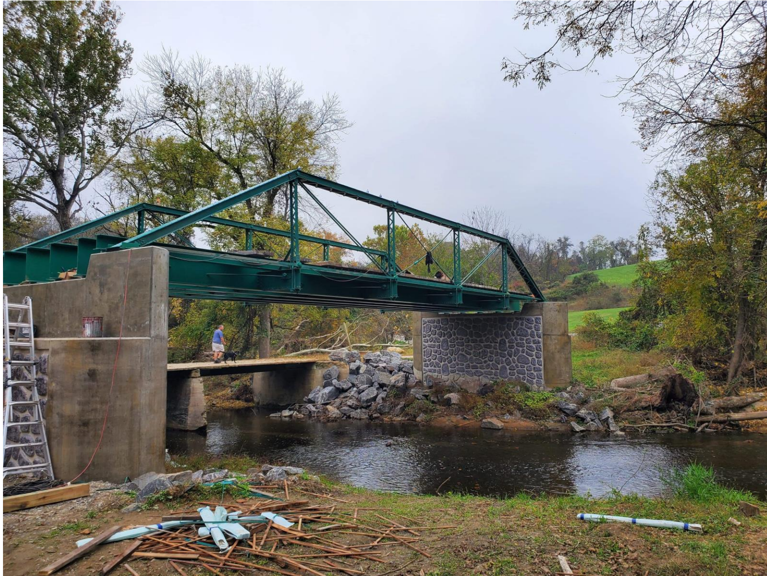
Assembled bridge in place.