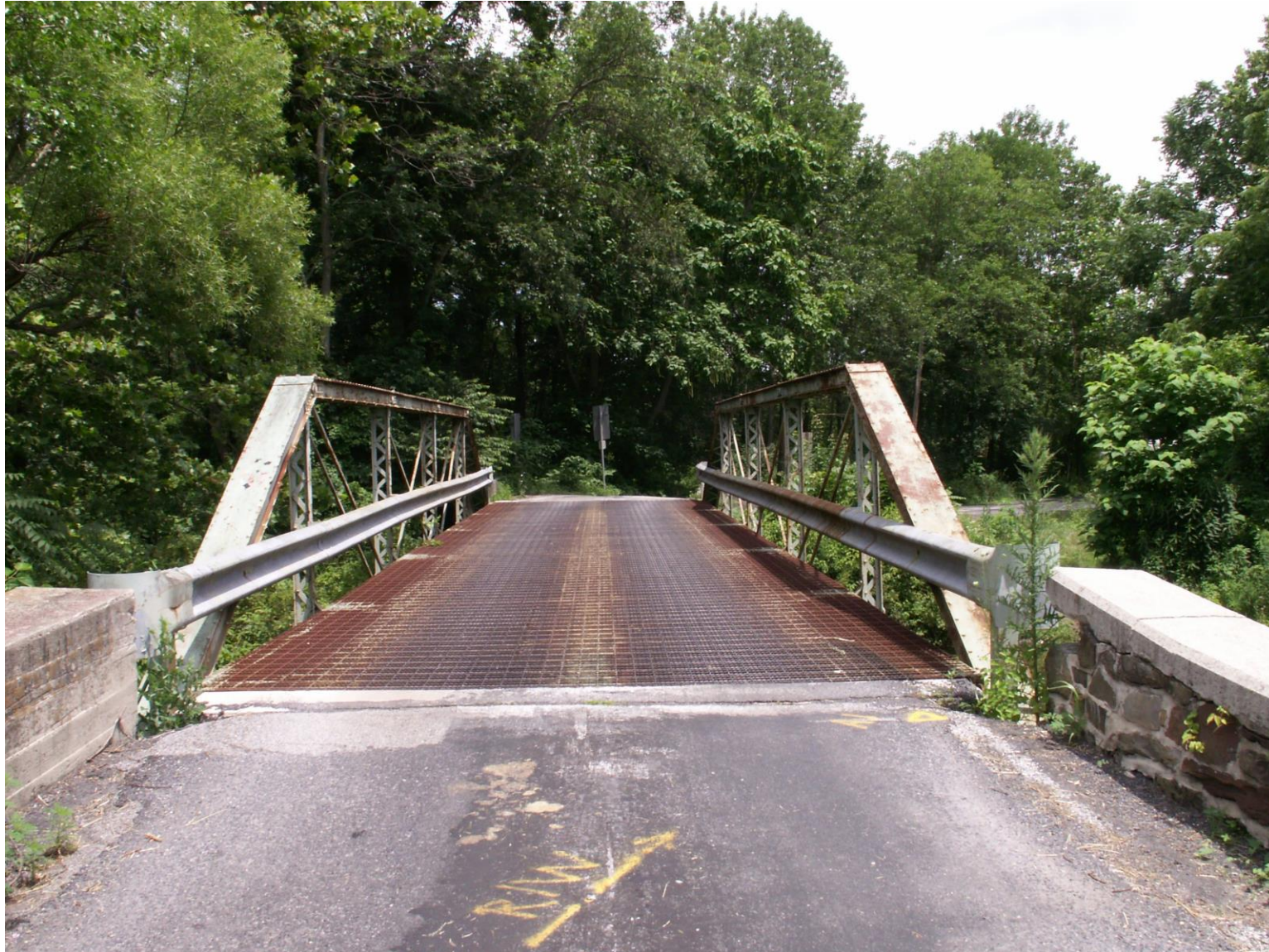
Bridge before relocation.