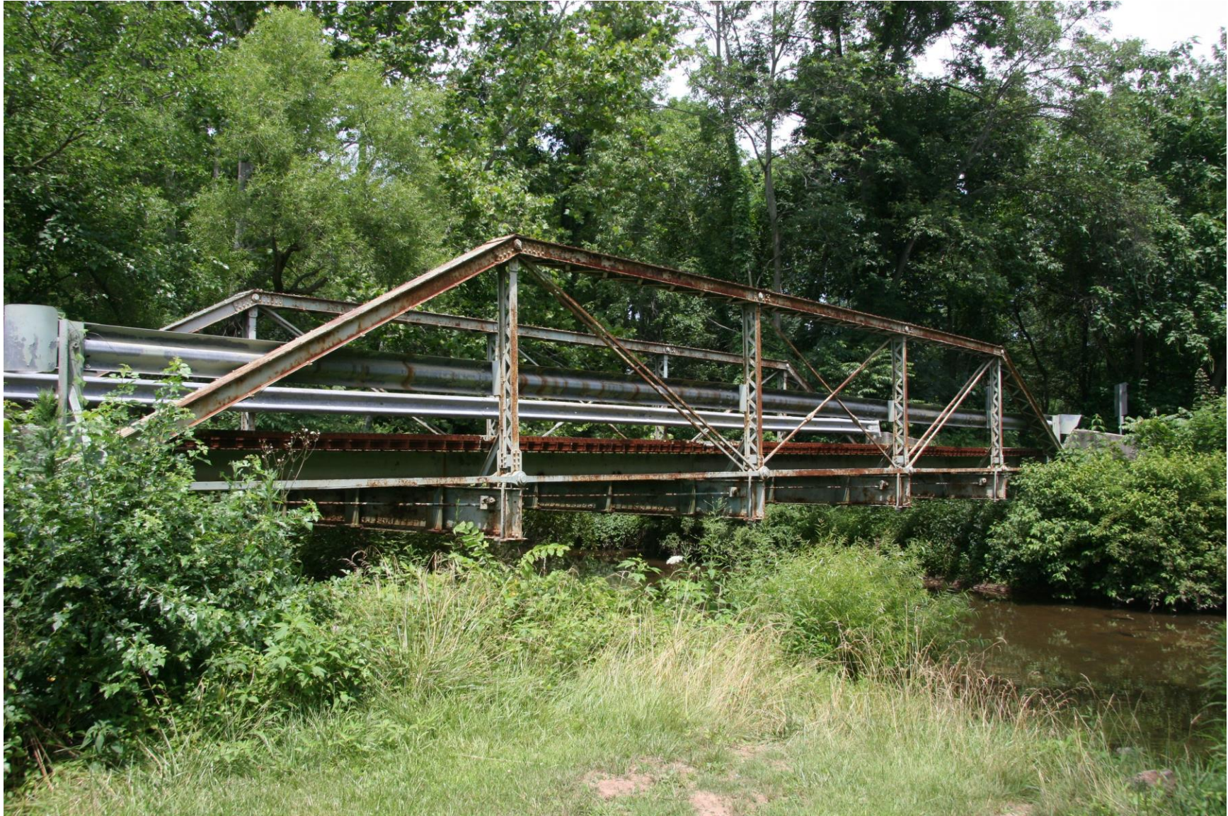
Bridge before relocation.