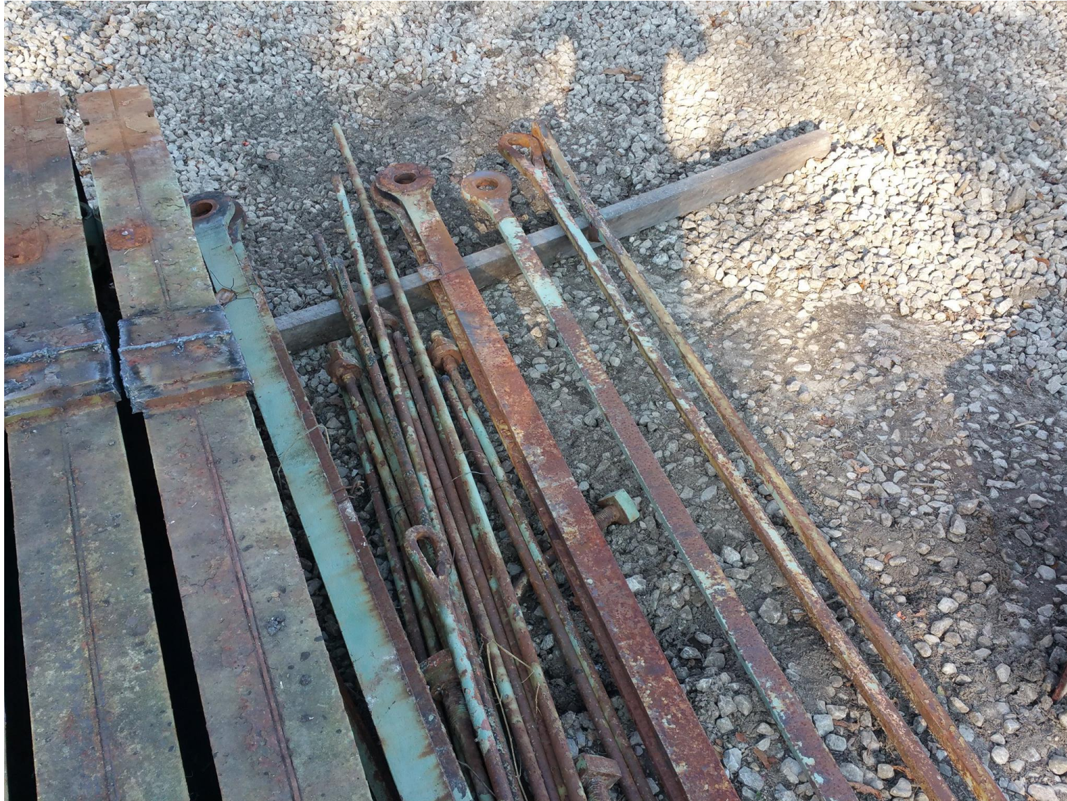
Bridge parts after being dismantled.